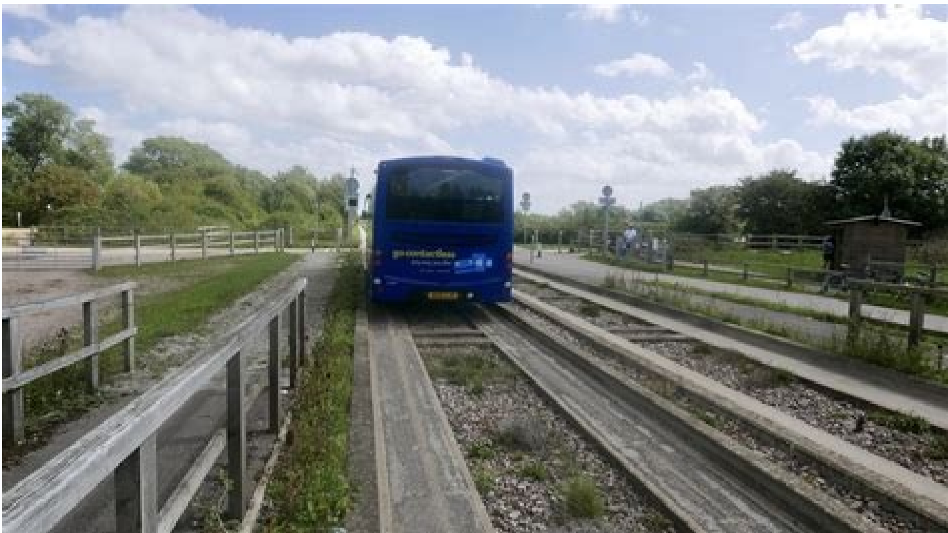
Guided bus timetable huntingdon to cambridge.