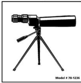
Model # 78-1236