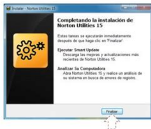
8. Al oprimir la opción Finalizar abre una nueva pantalla en la cual podemos iniciar el análisis, oprimiendo el botón Iniciar Análisis.